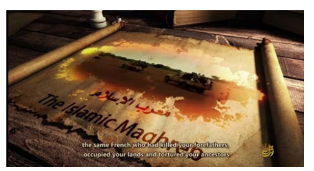
Figure 3: "Message from the Frontlines"(as-Sahab Media, September 2017)

France's military involvement in Iraq and Syria, which earned it the qualification of being the "small zealous France in the International coalition against the Caliphate", only comes as the latest layer of grievances and accusations regarding its perceived longstanding hostile actions in Muslim countries. <sup>9</sup> From a political and military standpoint, in addition to being an ally and supporter of the United States and Israel, <sup>10</sup> France has been criticized for its various counter-jihadist operations, be it in coalitions or in cooperation with Muslim regimes hostile to Islamist and jihadists movements. Its military involvement in Afghanistan, the participation of French peacekeepers in the UNIFIL force in Lebanon in 2006, <sup>11</sup> perceived as a US-Israeli operation to support Israel's position in the area, are but a few examples of actions quoted by jihadist leaders as warranting retaliation. <sup>12</sup>