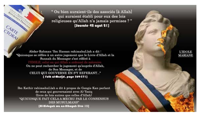
Figure 4: "The idol Marianne", poster released in several Telegram channels ahead of the French 2017 presidential elections

On top of all this, France is targeted by jihadists for its very essence, for being the so-called "flagship of disbelief". Like other Western countries, its modus vivendi is qualified as perverse ("fornication and homosexuality being banalized"), <sup>38</sup> but France is also singled out for its personification in the figure of Marianne, who is stigmatized as an idol and the French as idol worshippers. <sup>39</sup> Consider, for instance, this sentence from the ISIS claim for the 13 November 2015 attack, which refers to "hundreds of idol worshippers having been targeted in a celebration of perversity". <sup>40</sup>