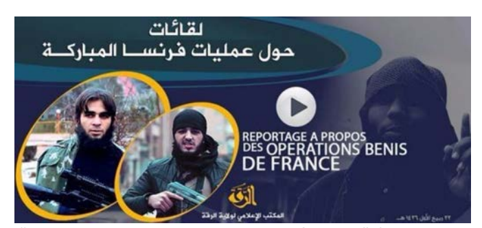
Figure 2: "Report on the blessed operations of France" (Wilayat al-Raqqah - January 2015)

Similar to other countries participating in the international coalition against ISIS, jihadists' legitimation of recent attacks against France include the immediate reprisal narrative , namely that the attacks avenge France's military involvement in the coalition. As early as January 2015, ISIS released a video featuring French fighters legitimizing the Paris attacks conducted a few days earlier because the French "do everything to destroy the Khilafah". 7