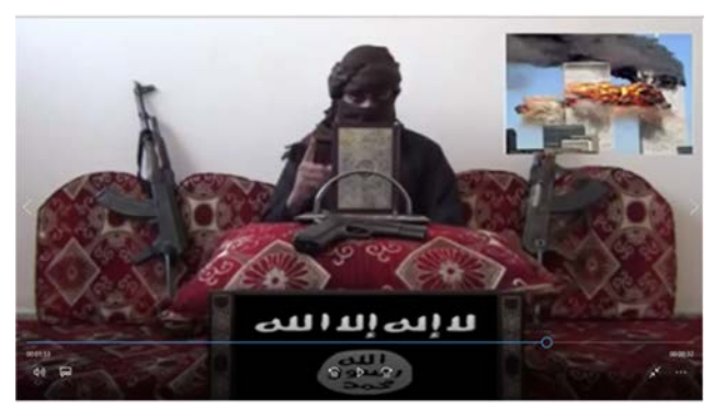
Figure 1: "Message to France on behalf of Mujahideen from Sham" (January 2013)<sup>2</sup>

This "Message to France on behalf on Mujahidin from Sham" was released in a video in French in January 2013.