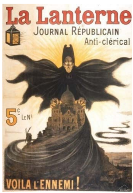
Figure 5: Frone page of anticlerical paper "La Lanterne": Here is the enemy!" 1902, https://www.histoire-image.org/etudes/mouvement-anticlerical-veille-1905

the Dreyfus affair, <sup>41</sup> has been used as a political and antireligious weapon since the French Revolution and the subsequent de-Christianisation. This heritage contrasts with a satirical press in the UK or the United States which has usually been more respectful of religion. <sup>42</sup> This corrosive nonconformity and provocative disrespect are repeatedly quoted by jihadist propaganda: "France (...) never stopped insulting and mocking the prophet Muhammad through caricatures and attacking Islam in heinous movies". <sup>43</sup>