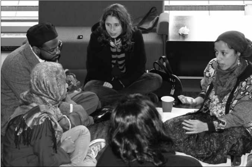
NYU Of Many Institute for Multifaith Leadership

classroom. They also could be very useful for high school extracurricular clubs, especially those focused on interfaith engagement, diversity, and service. While we hope that in the longer term religious literacy education becomes fully integrated into the education system, early use of the examples mentioned above in extracurricular clubs may be a good first entry point for schools and districts interested in supporting religious literacy education but concerned about constitutionality in required education.