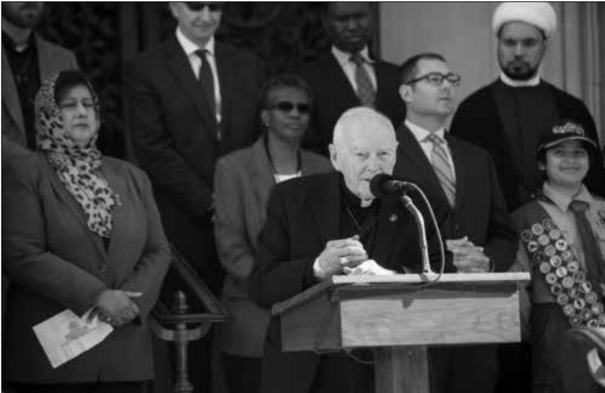
West End Strategy Team for Shoulder-to-Shoulder

The central story of the Abrahamic faith traditions, that there is one God, is already a shared story, and it carries a deep meaning that we often overlook. Monotheism tells us that human beings are all related; we are cousins and a part of the essential “us” that makes up humanity. This universalism was a radical shift from the tribalism of the ancient world, where each tribe had a god. When people fought, their gods fought. Tribal division and violence was in some sense sacred, since the gods participated in it. But monotheism changed this. When tribes fought, instead of tribal gods fighting in the heavens, there was (and is) one Creator saying, “stop fighting.”