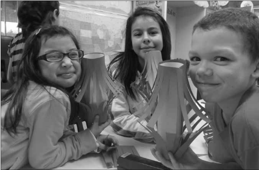
Boys & Girls Club of Skagit County

There could be a great appetite for an updated version of the Youth for Unity program that draws on more contemporary issues and experiences, and gives youth concrete opportunities to put their knowledge and skills into practice, for example through resource toolkits to equip Club leaders to run intergroup service learning programs with intentional opportunities for reflection. An updated program could also make use of recent technological developments, for example by connecting youth in homogeneous areas to those in more diverse areas through low-cost video-conference-based dialogue (see the resources section at end of this essay).