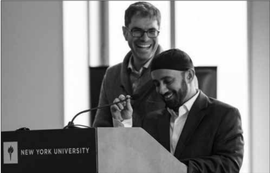
NYU Of Many Institute for Multifaith Leadership

What Jewish students are learning is that those of other faiths share much of their investment in the campus community and merit resilient listening. Provocateurs, media outlets, and talking heads who parachute into the campus for a night do not in the same way. Sorting this out will take time, and will require mining various religious and moral traditions for what ought to be the bedrock of our society: the capacity to listen.