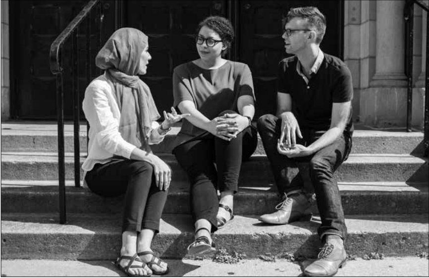
Interfaith Youth Core

by faith communities and welcome diversity, they also have an opportunity to model retaining particularity while achieving pluralism.