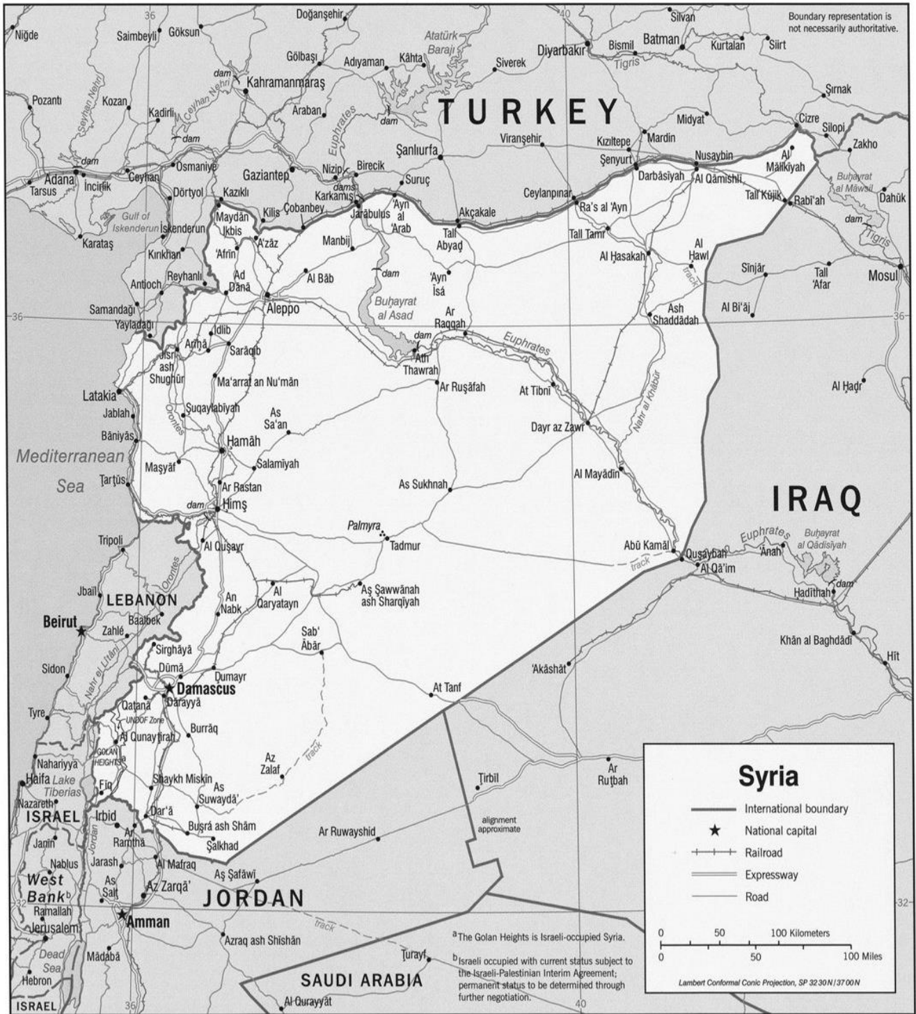
Map of Syria: The University of Texas at Austin, “The Perry-Castañeda Library, Middle East Maps,” 2024.