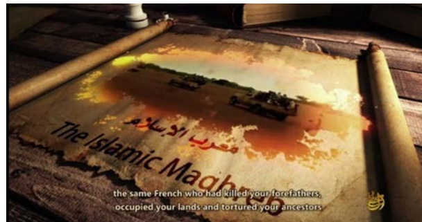
Figure 3: "Message from the Frontlines"(as-Sahab Media, September 2017) (author's archives, video originally downloaded from al-Qaeda-linked social media)

France's military involvement in Iraq and Syria, which earned it the qualification of being the "small zealous France in the International coalition against the Caliphate", only comes as the latest layer of grievances and accusations regarding its perceived longstanding hostile actions in Muslim countries. 9 From a political and military standpoint, in addition to being an ally and supporter of the United States and Israel, 10 France has been criticized for its various counter-jihadist operations, be it in coalitions or in cooperation with Muslim regimes hostile to Islamist and jihadists movements. Its military involvement in Afghanistan, the participation of French peacekeepers in the UNIFIL force in Lebanon in 2006, 11 perceived as a US-Israeli operation to support Israel's position in the area, are but a few examples of actions quoted by jihadist leaders as warranting retaliation. 12