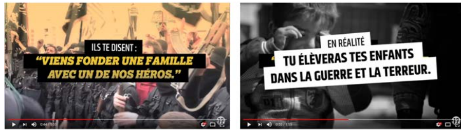
Figure 8: The "They tell you..." #StopDjihadisme campaign ( https://www.youtube.com/watch?v=ke3i9-7kkQM )