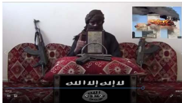
Figure 1: “Message to France on behalf of Mujahideen from Sham” (January 2013) 2

This “Message to France on behalf on Mujahidin from Sham” was released in a video in French in January 2013.