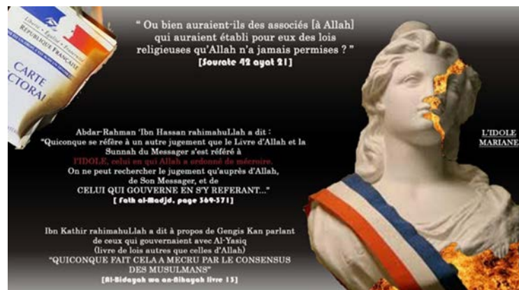
Figure 4: “The idol Marianne”, poster released in several Telegram channels ahead of the French 2017 presidential elections

On top of all this, France is targeted by jihadists for its very essence, for being the so-called “flagship of disbelief”. Like other Western countries, its modus vivendi is qualified as perverse (“fornication and homosexuality being banalized”), 38 but France is also singled out for its personification in the figure of Marianne, who is stigmatized as an idol and the French as idol worshippers. 39 Consider, for instance, this sentence from the ISIS claim for the 13 November 2015 attack, which refers to “hundreds of idol worshippers having been targeted in a celebration of perversity”. 40