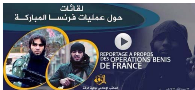
Figure 2: “Report on the blessed operations of France” (Wilayat al-Raqqah - January 2015) (author’s archives, video originally downloaded from ISIS-linked social media)

Similar to other countries participating in the international coalition against ISIS, jihadists’ legitimation of recent attacks against France include the immediate reprisal narrative , namely that the attacks avenge France’s military involvement in the coalition. 6 As early as January 2015, ISIS released a video featuring French fighters legitimizing the Paris attacks conducted a few days earlier because the French “do everything to destroy the Khilafah”. 7