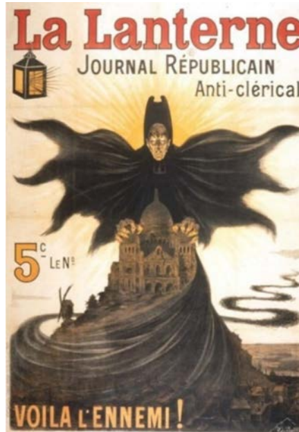
Figure 5: Front page of anticlerical paper “La Lanterne”: Here is the enemy!” 1902, https://www.histoire-image.org/etudes/mouvement-anticlerical-veille-1905

the Dreyfus affair, 41 has been used as a political and antireligious weapon since the French Revolution and the subsequent de-Christianisation. This heritage contrasts with a satirical press in the UK or the United States which has usually been more respectful of religion. 42 This corrosive nonconformity and provocative disrespect are repeatedly quoted by jihadist propaganda: “France (...) never stopped insulting and mocking the prophet Muhammad through caricatures and attacking Islam in heinous movies”. 43