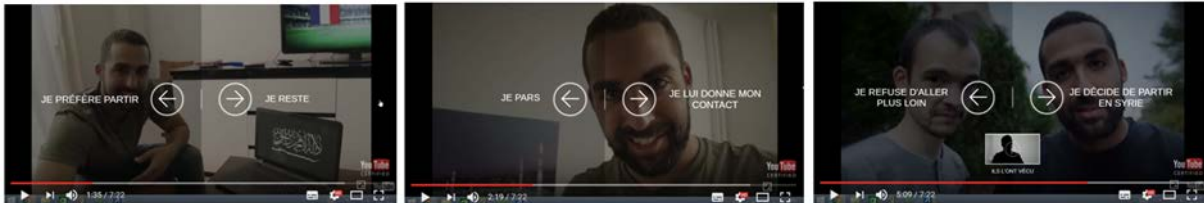
Figure 9: The "Always a choice" #StopDjihadisme campaign ( https://www.youtube.com/watch?v=COA7zRVMwLs )

Despite their large reach (2 million views in less than a month for “they tell you”, and 8 citizens out of 10 having seen the “#ToujoursLeChoix campaign”), the French government’s expectations were not met for at least two reasons. 98 First, in the case of the “they tell you” campaign, French authorities were positioning themselves in a defensive stance against the offensive pull factors of ISIS’ narratives, directly countering its promises of an opulent Caliphate and military victories (coloured pictures) with the harsh reality (black-and-white pictures). In adopting a reversed Manichean view from that of ISIS, the authorities were fighting on the same ground, thus providing “oxygen” the opponent’s narratives by just mentioning them. 99 But above all, as official state communications, these campaigns were met with considerable scepticism the jihadist milieu, thus generating at best indifference and at times resentment and mockery. For instance, some jihadists responded to the “#AlwaysAChoice” campaign with the hashtag “#NoChoice”. Lastly, the campaigns were linked to the reporting body of radical behaviours, thus implying their association with law enforcement and generating suspicion on that account.